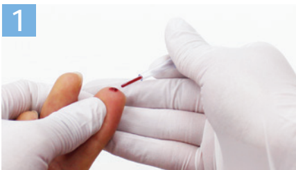
Step 1: Collect blood