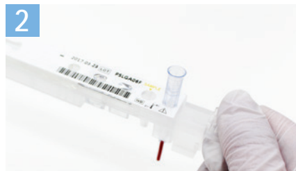
Step 2: Place the C-tip™